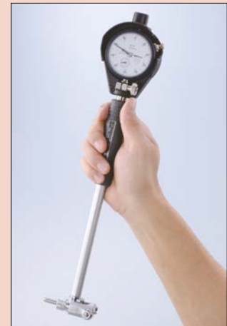
New grip improves accuracy during prolonged use.