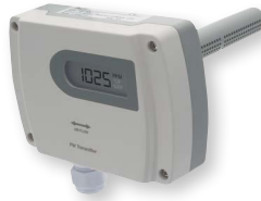
Duct mount with LCD