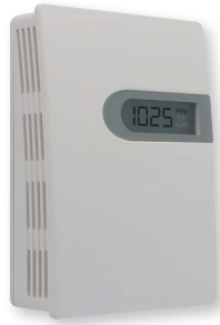
Wall mount with LCD