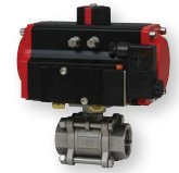
Model SN mounted to an actuator