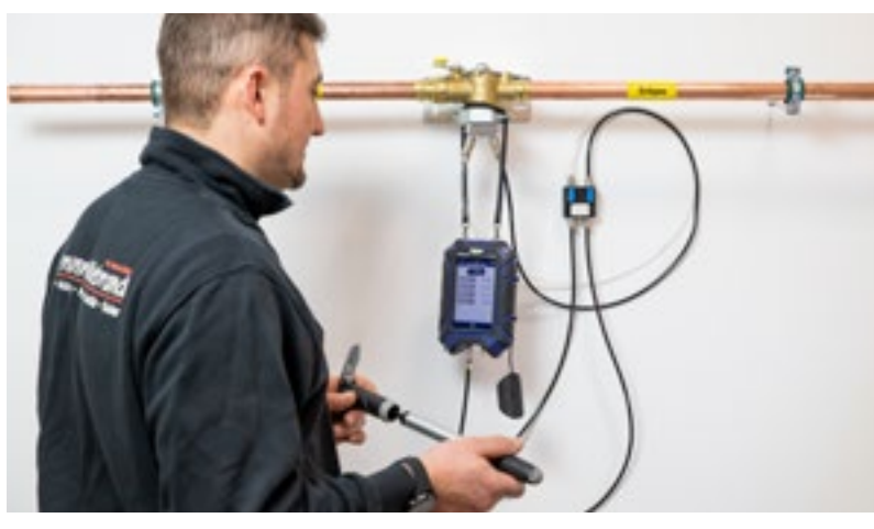
With the appropriate connection accessories, the newly installed gas pipe is simply pressurised with the test pressure for the stress test (1,000 hPa).