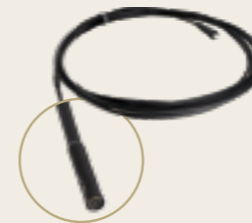
HD-Video-Endoscope-Probe (3 Cameras) Ø 7.9 mm / 10 m / 0° / 2 x 90°