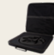
Large protective bag for Wöhler VE series and probes