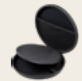
Protection bag for Wöhler VE series and probes