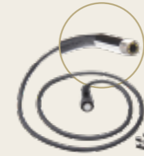
HD-Video-Endoscope-Probe Ø 5.5 mm / 1.2 m