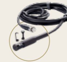
HD-Video-Endoscope-Probe (2 Cameras) Ø 8.5 mm / 3 m / 0° / 90°