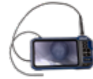
Wöhler VE 500 HD-Video-Endoscope