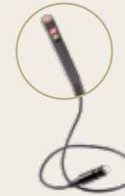
HD-Video-Endoscope-Probe (2 Cameras) Ø 5.5 mm / 1 m / 0° / 90°