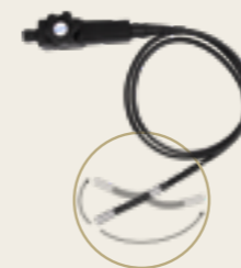
HD-Video-Endoscope-Probe (swivelling) Ø 6.2 mm / 1.5 m / 180°