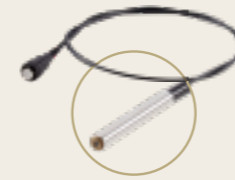
HD-Video-Endoscope-Probe Ø 3.9 mm / 1 m