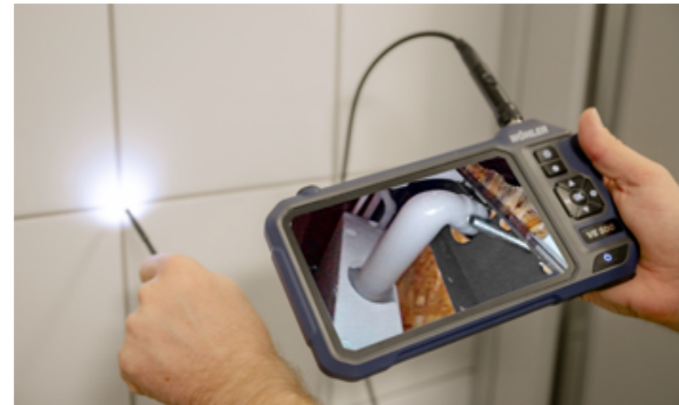
A Ø 6 mm opening in a tile cross is sufficient to inspect the installation behind the wall.