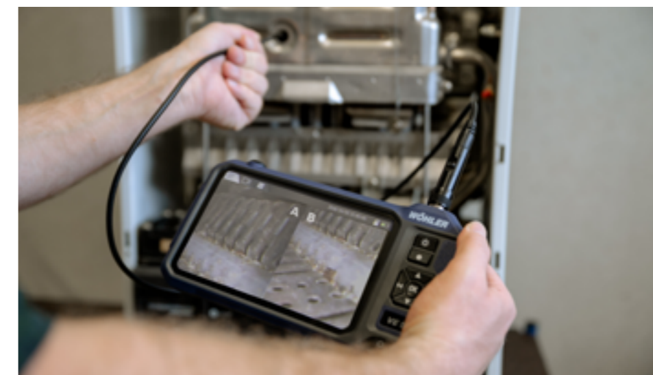
The split-screen mode allows you to display both camera images of the combination probe simultaneously to capture everything at a glance.