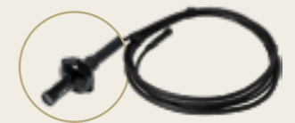
HD-Video-Endoscope-Probe (3 Cameras) Ø 25 mm / 10 m / 0° / 2 x 90° with roller guide