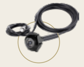
HD-Video-Endoscope-Probe Ø 25 mm / 3 m