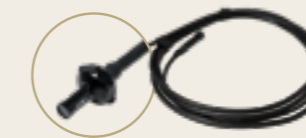
HD-Video-Endoscope-Probe (3 Cameras) Ø 25 mm / 5 m / 0° / 2 x 90° with roller guide