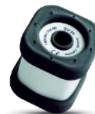
SV 34B Class 2 acoustic calibrator 114 dB at 1 kHz