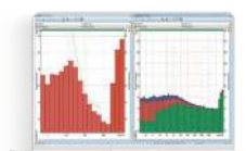
SF 104BIS_3OCT License of 1/1 & 1/3 octave